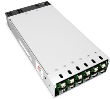
Advanced Energy's CoolIX 1800