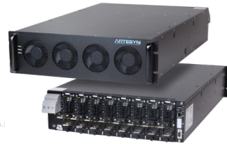
Advanced Energy's Artesyn iHP Series